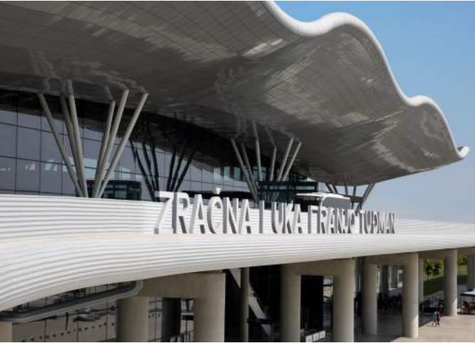
Exterior view of Zagreb's Franjo-Tudman International Airport in Croat.

After a good winter season, with passenger traffic up 13% on last year, Zagreb Airport is forecasting strong growth for the 2024 summer season, driven by the arrival of new routes.