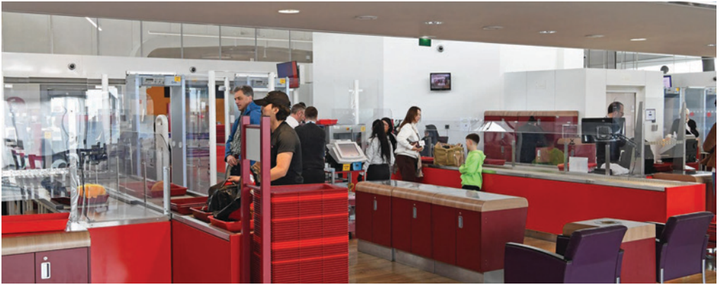
The Baggage and Terminal Divisions at Paris-Charles de Gaulle and the Information Systems Division worked together on this project.