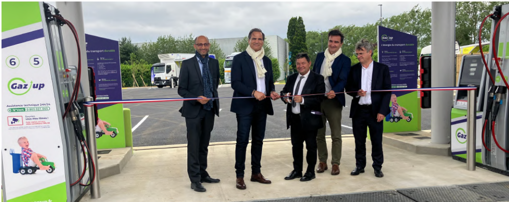
Representatives of the Real Estate and Sustainable Development Divisions at the official opening of the station in June.