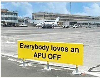
Dozens of signs displaying the messages were in strategic location around Paris-Le Bourget Airport.

How can we encourage operators and pilots to moderate the use of APU (Auxiliary Power Units) at Paris-Le Bourget? This is the aim of the original and unique communications campaign devised by the airport management teams.