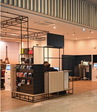
The baggage storage facility is located in the public area, on the arrivals level of Orly 3, opposite the baggage reclaim exit.