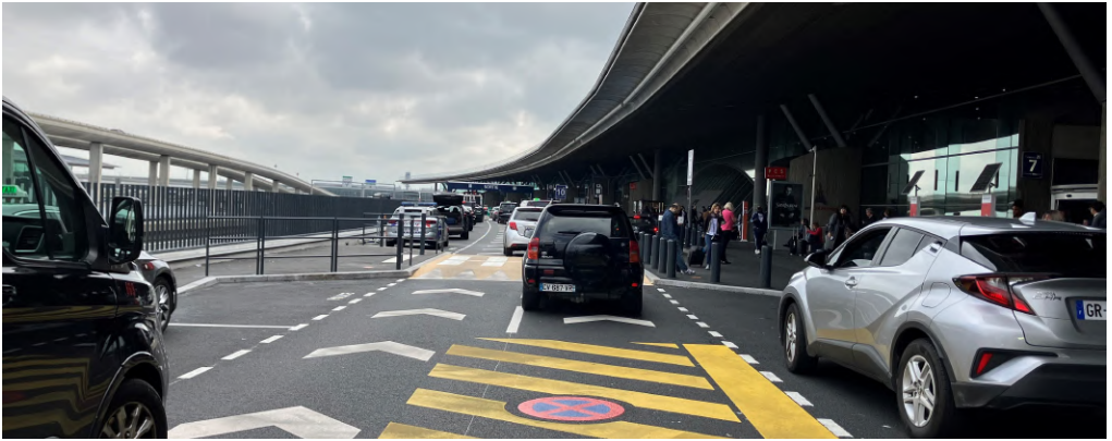
Terminal 2E drop-off area. An optimised layout for better traffic flow.