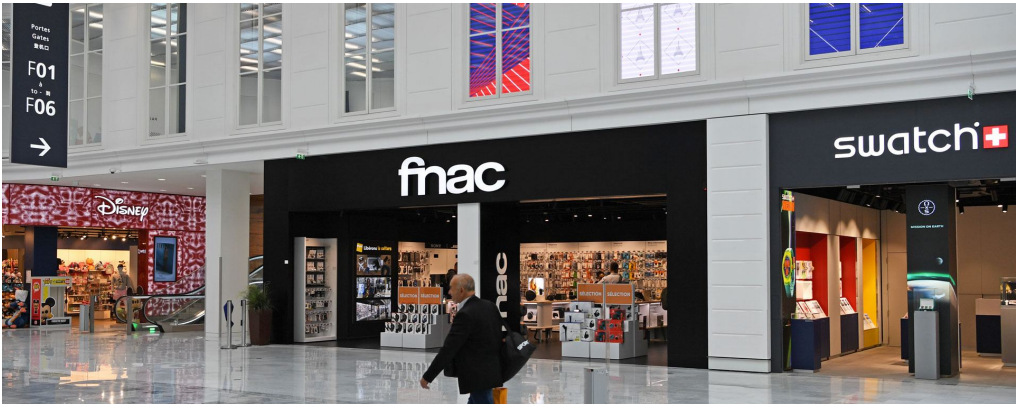
The new "rue Parisienne" (Parisian Street) shopping area is part of the RPDI (overhaul of the international departures process) project at Orly 4.