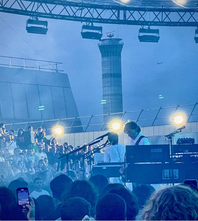
Performance by the group AIR at the concert on the roof of Terminal 1 at Paris-Charles de Gaulle.

On 17 July, the roof of Terminal 1 at Paris-Charles de Gaulle played host to the best of French house music, in front of almost 2,000 spectators. The concert was broadcast live on Amazon Prime as well as the Amazon Music Twitch channel and was viewed by tens of thousands of Internet users.