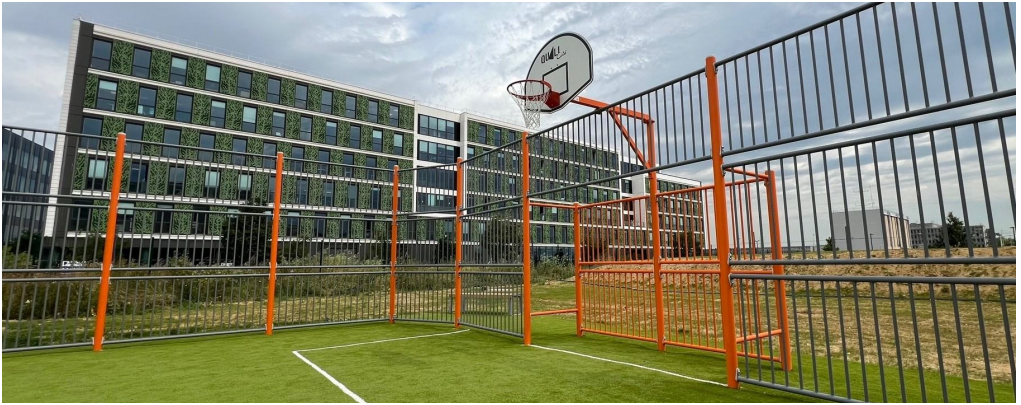
A city stadium opens in the Cœur d'Orly district.