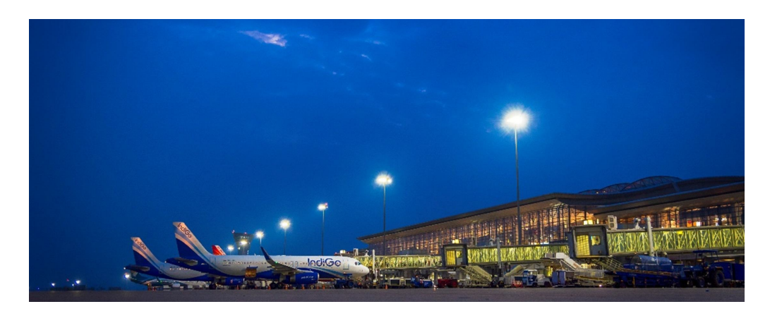
Aéroport international Rajiv Gandhi d'Hyderabad.