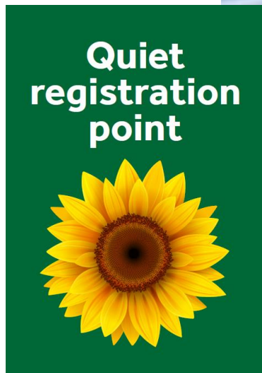
Carrington Building (close to the marquee)

Inside the marquee does get busy at times, and we offer a quiet registration point in the Carrington Building (135 on the Open Day Map) , where you can check in and get information and advice about the day in a less busy environment. Look for the sunflower signposting.